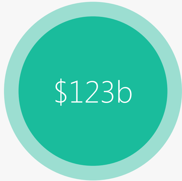
Global digital health market (in 2017)