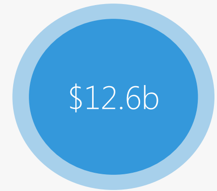
Wellness apps of mHealth market (in 2017)