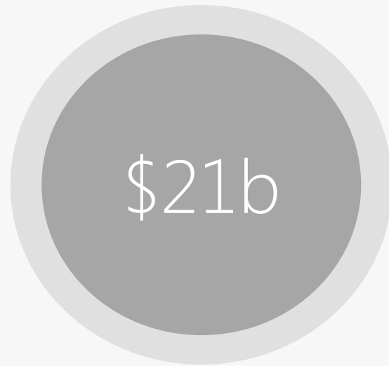
Global mobile health market (in 2017)