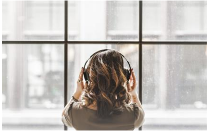
Listening to music

a year with Wellmee (experiencing hundreds of activities)