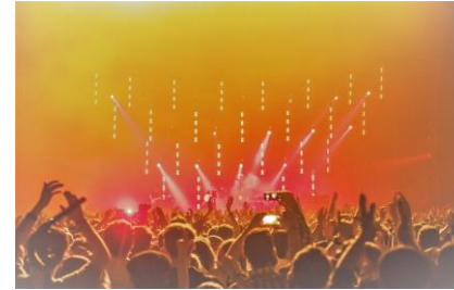
Attending a concert