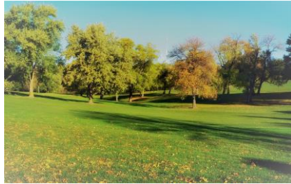
Walking in a park