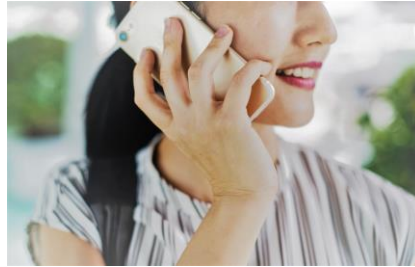
Calling to a friend